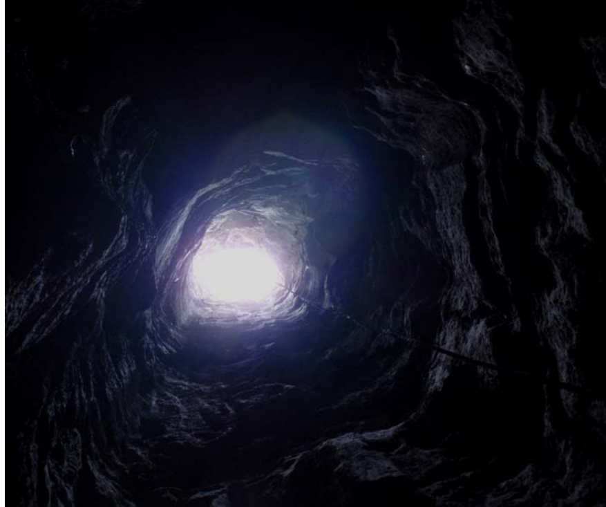
View up the shaft.