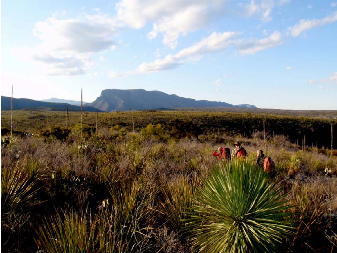
Heading back to camp after the mapping of Pozo Brazo del Sol.